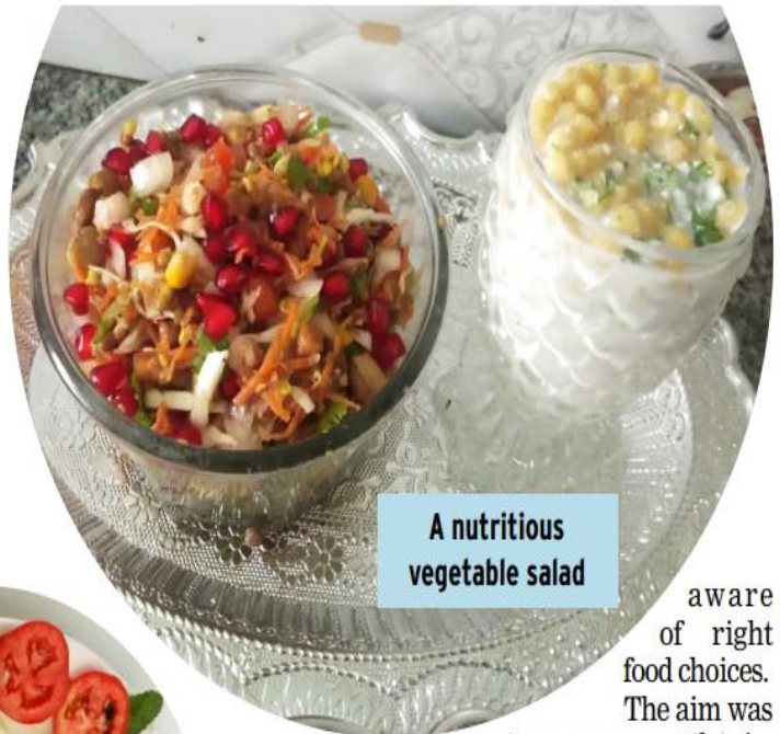
A nutritious vegetable salad

September 4: Students and parents attended a live event 'Hamara Ayush Hamara Swasthya', a national webinar to