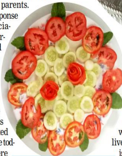
Salad decoration by parents

Participants explained the speciality of their salads and the importance of salad to maintain good health. It was a very enriching experience for all.