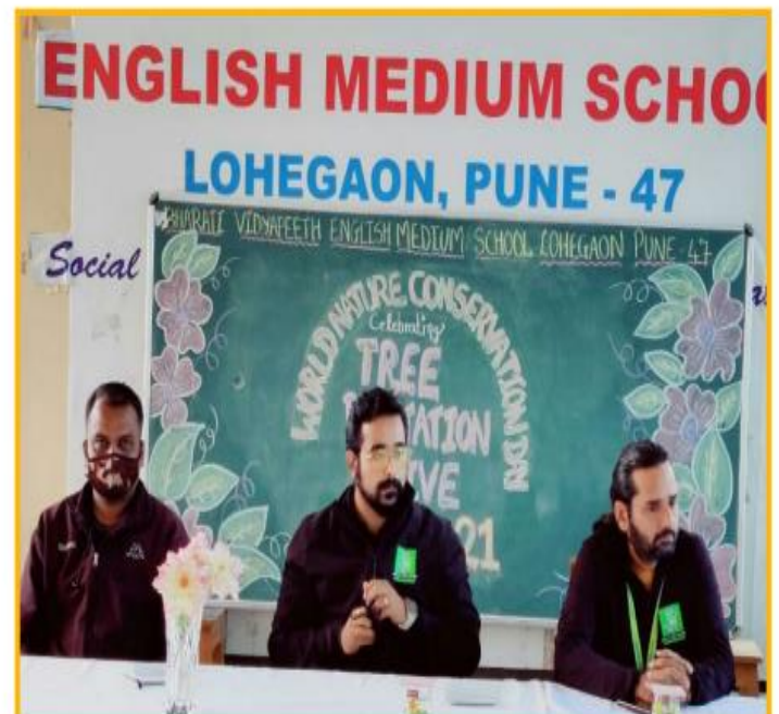
'World for nature' initiates tree plantation