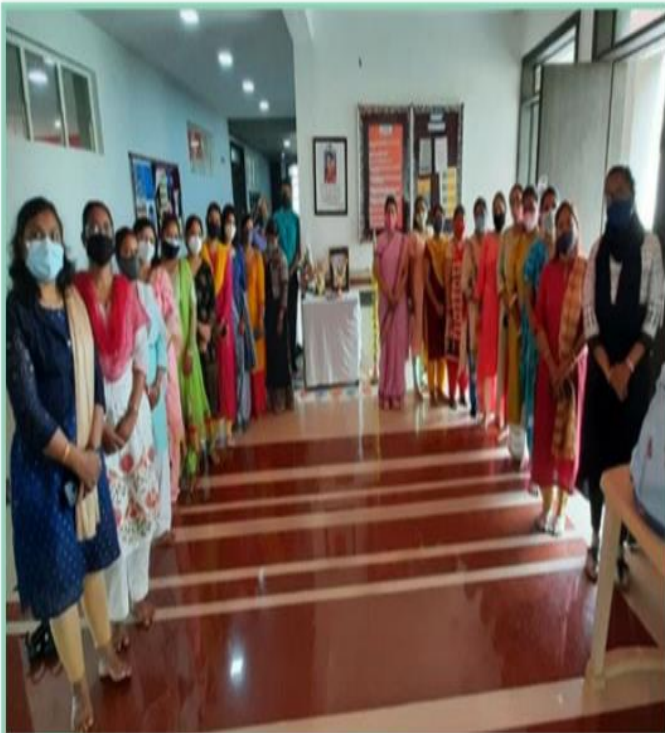
BVEMS, Lohegaon staff celebrates Guru Purnima

of Guru. Activities were held for the students: Classes I to IV made greeting cards. Classes V to VIII made a video of themselves with a message for their teacher. Classes IX to X made a collage which included poetry verses composed by them with images.