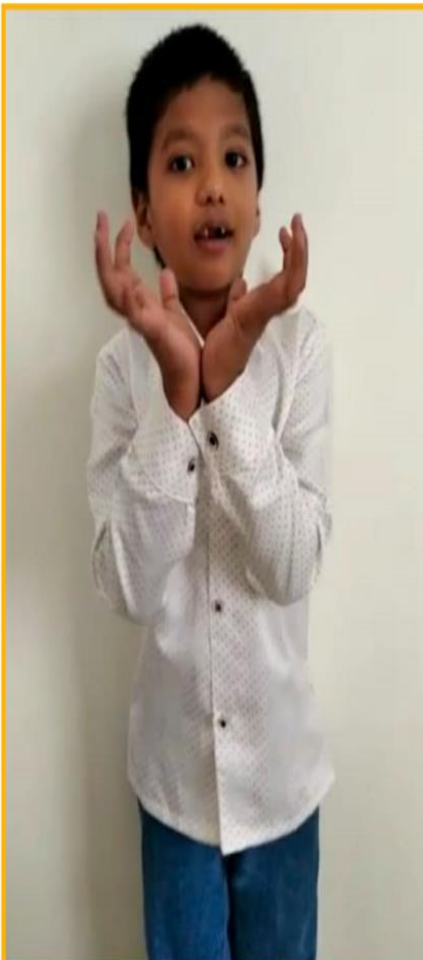
Students performed brilliantly

As English has gained the status of an international language, it helps to enhance communicative skills in English. The Bharati Vidyapeeth English Medium School, Lohegaon, adopts a communicative approach to enhance the speaking skills of its students. The literary club of the school conducted activities with not only the primary aim to enhance the communicative skills of the students but also to identify the problems of the students who are structurally competent in writing but cannot communicate appropriately.