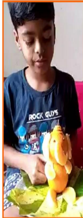
Students made their own style Ganesha with eco-friendly materials