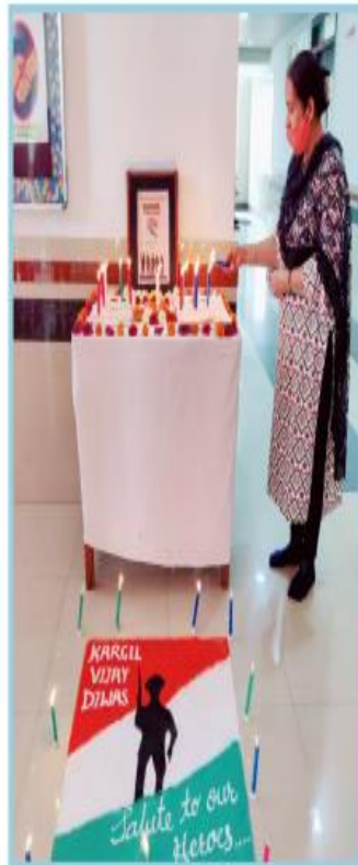
Teachers light candles to pay tributes

The entire staff paid homage to the soldiers of Kargil by lighting the candles and two-minutes silence was ob-