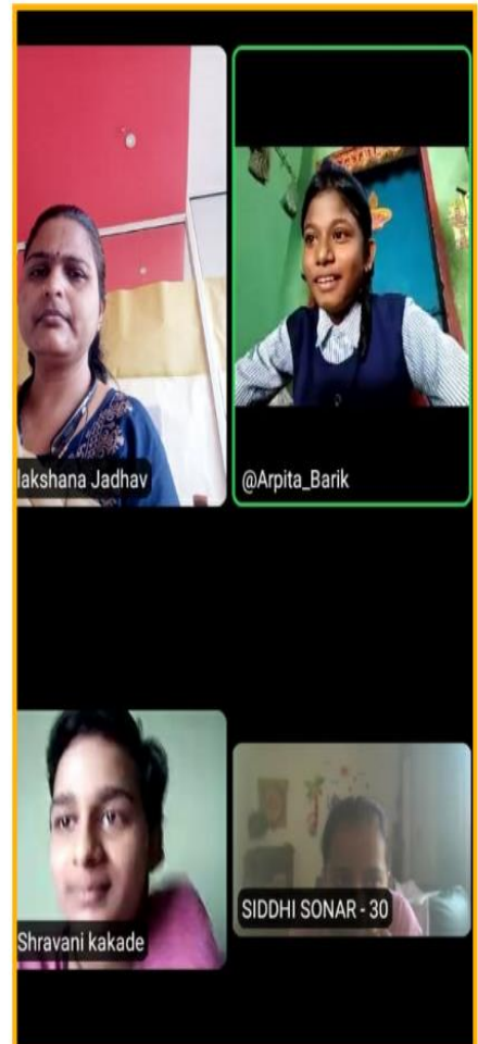
The extempore English activity