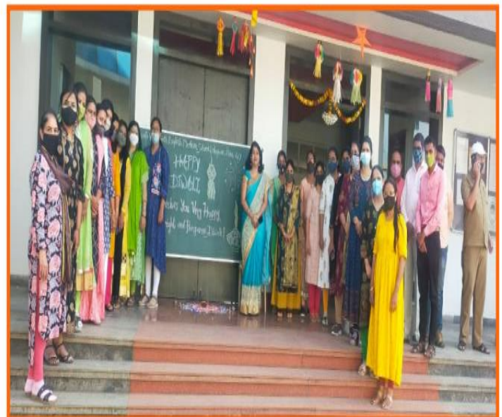
Teachers celebrate Diwali