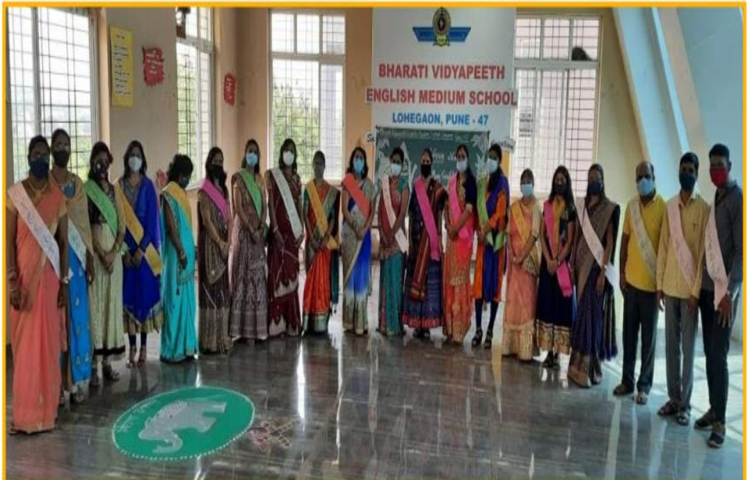
Teachers walk the ramp

N avratri Utsav was held for teachers in the school auditorium Bharati Vidyapeeth English Medium School, Lohegaon. Navratri symbolises the victory of Devi Durga over Mahishasura. Each day of the Navratri is dedicated to nine incarnations of Maa Durga. Navratri is special for all devout Hindus. The day