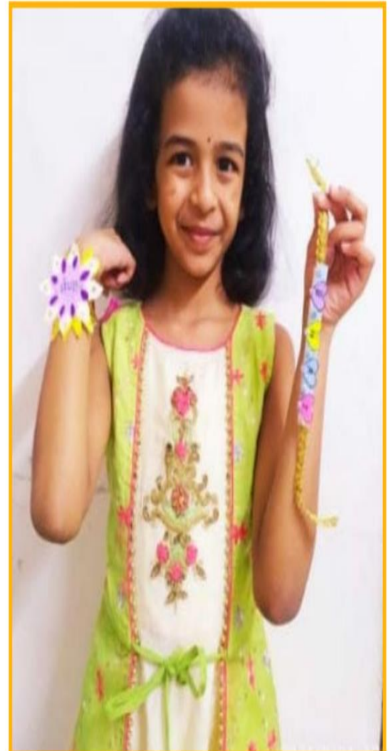
Students participate in rakhi making