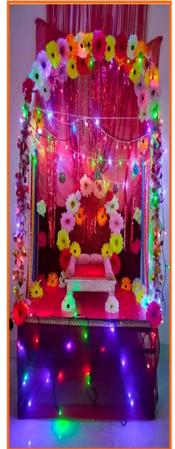
Home decoration for the Ganeshotsav