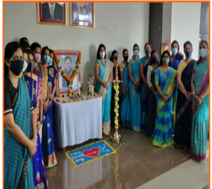
BVEMS, Lohegaon Staff celebrates doctors