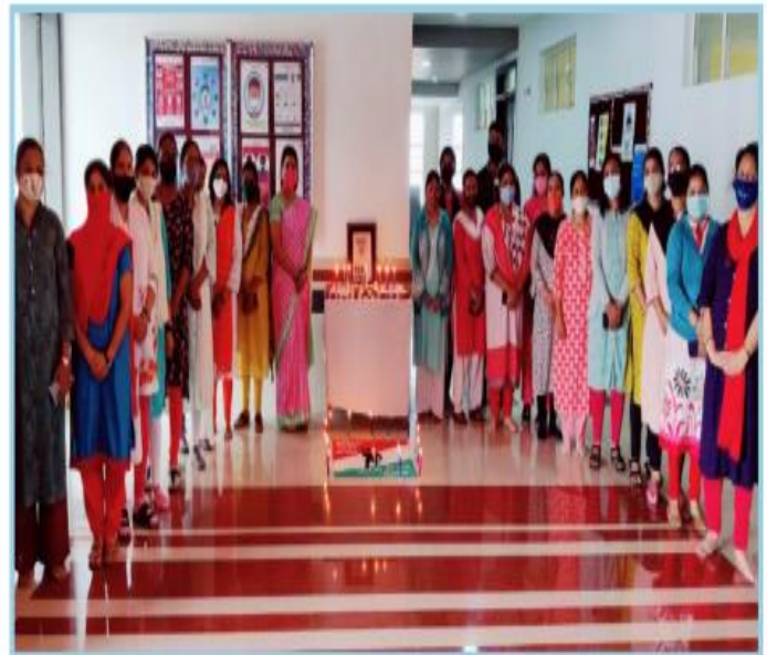
The staff pays homage to war heroes

served. The candles illuminated the venue and made it peaceful. An inspirational video was screened for all the students to realize the sacri-